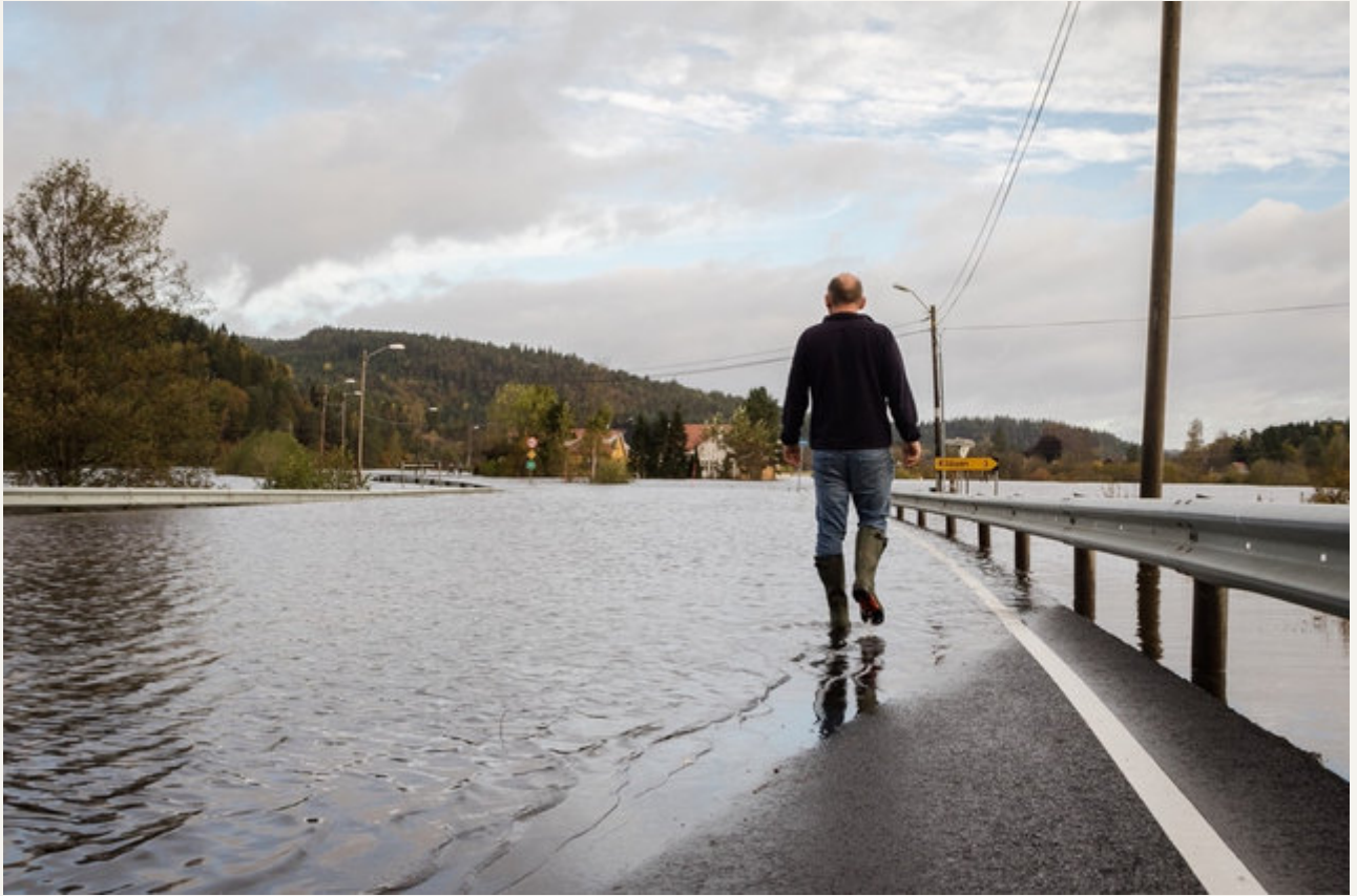
The Norwegian case with flash floods