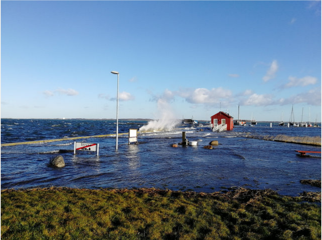
The Danish case with flooding from the sea