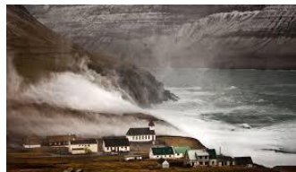
Case 8 Faroe Islands Storms