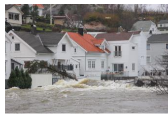
Case 6 Norway Flash floods