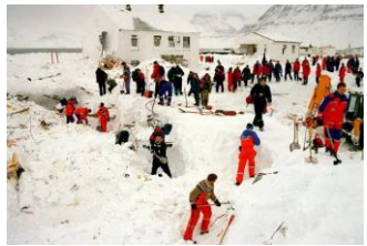
Case 7 Iceland Avalanches